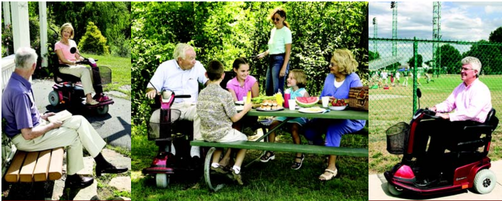
Celebrity® X 3-wheel